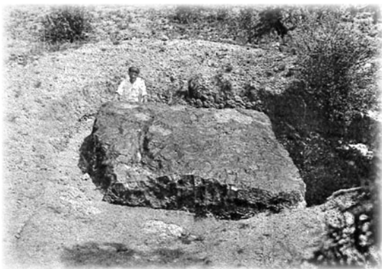
Fig. 2 Samuel Gordon, the second ever scientist to visit the meteorite (3 months after the L.J. Spencer party), photographed during his December 1929 expedition.

On his return to Philadelphia Gordon determined the specific gravity of the meteorite as 7.971, while two surfaces of his own sample – “of about 80 square cm. and 30 square cm.” – were tested for hardness and then polished, etched and examined microscopically. The surfaces showed eight “elongated patches of troilite” 5 , some graphite and an oriented sheen when viewed at an angle. “More remarkable are veins and areas of intersecting lines,