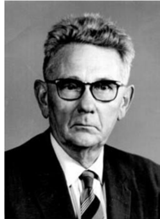
Fig. 4 (above) Hoba enters the public domain: the heading in Die Volksblad of Saturday, 23 February 1929.