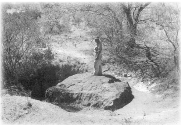
Fig. 1 Although of unknown date, this is almost certainly the earliest known photograph of the Hoba meteorite.

In Part I of this article series (Spargo, 2008) we left the Hoba meteorite, no doubt quietly proud of its place in history as the most massive known object to have survived intact its plunge to Earth, in dignified repose in its partially excavated state in the bush in a remote part of a then relatively little-known territory, South-West Africa (Fig. 1). The date was 1921 and only a handful of people, either in South-West Africa or the neighbouring Union of South Africa knew of its existence. As far as can be ascertained no news of this remarkable find had yet penetrated to the outside world.